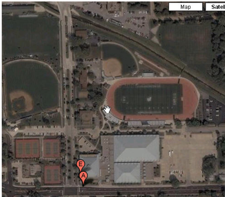
A topographical view of the facility.